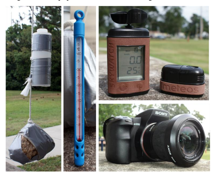
Figure 1: (clockwise) Water collection tool, temperature gauge, Meteos anemometer, Sony A200 camera

present within the water sample. Panoramic and ground images were also taken for each location to give a visual representation and documentation of the sampling sites. Images of this equipment can be found in Figure 1.