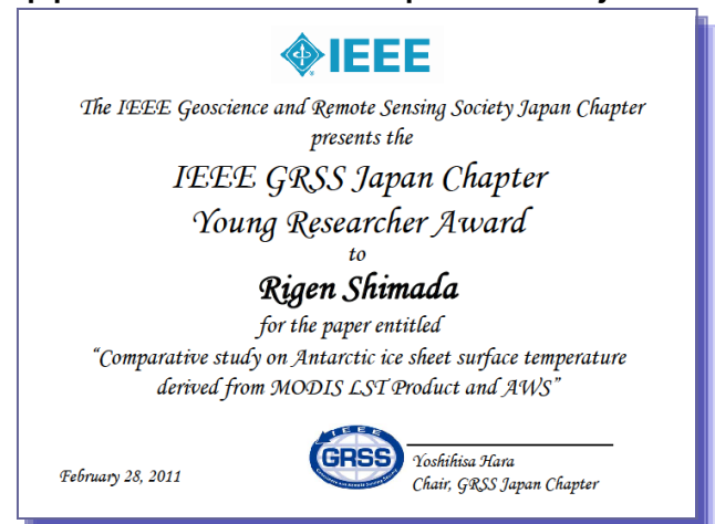
2011 Award Example