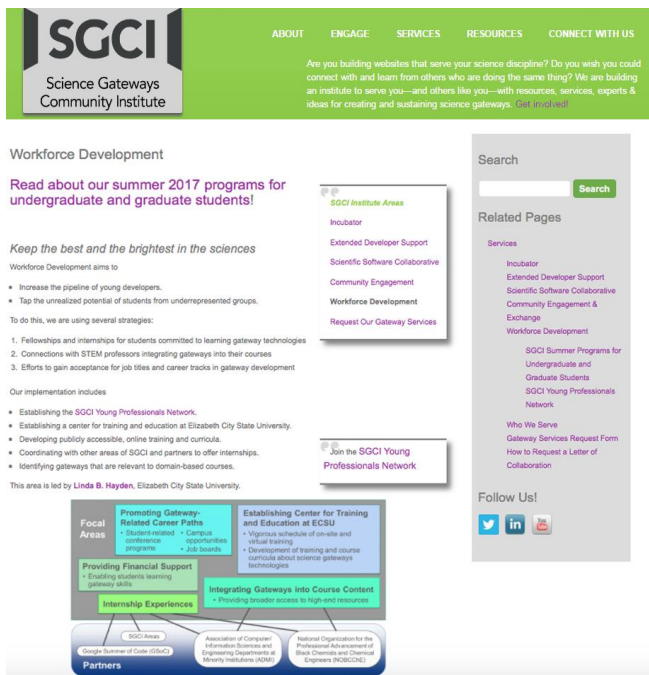
Fig. 1. Original SGCI Workforce Development Layout