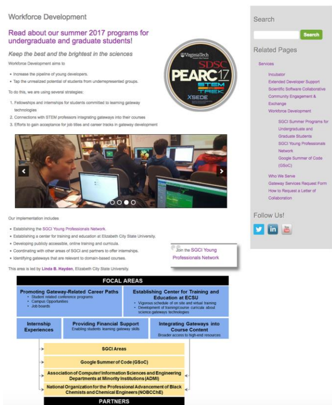
Fig. 2. Updated SGCI Workforce Development Layout

WordPress.org due to the allowance of modification via code and/or "shortcodes" which are used to utilize plugins in WordPress.org posts. The team then researched how to deploy a WordPress.org post using a bootstrap component.